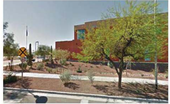
Polly Rosenbaum Arizona Library and Archives Building

Last year, the Genealogical library collection at the Arizona State Library was partially relocated to the Polly Rosenbaum building at 1901 W Madison Street in Phoenix . In February I visited the new location to check out the collection. If you are looking for genealogical materials formerly available at the Capitol building, this article will help you locate them in the new facility. The building is open Monday through Friday, 8:00 a.m. to 4:00 p.m.