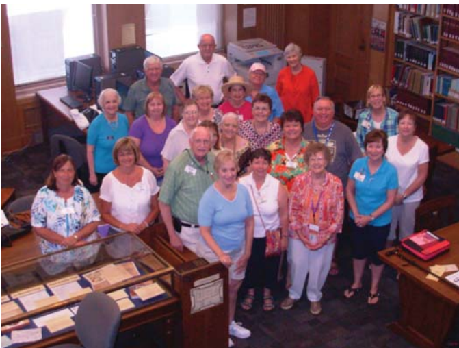
WVGS Members & one guest (see above) at the Arizona State Library.