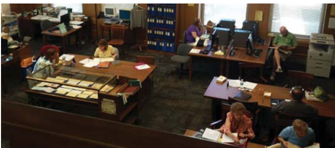
WVGS Members working in Arizona State Library.